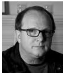
Charlie Peacock Friday, November 11, 2011