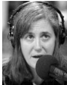
Amy Goodman Friday, January 13, 2012